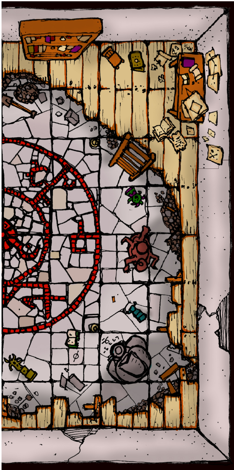
Art © Billiam Babble Inked Adventures 2012.